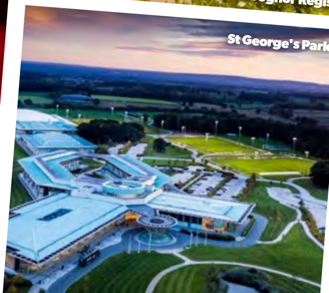
St George's Park