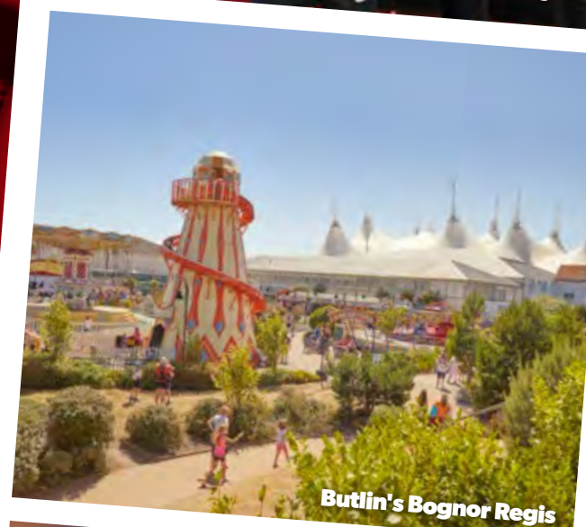
Butlin's Bognor Regis