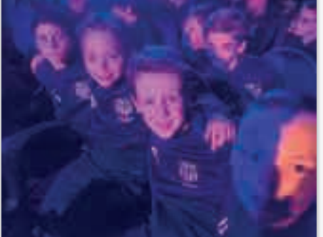
Thanks for an awesome tournament at ESF Butlin's Minehead 2017! Great job, we loved