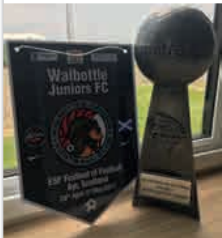
We've had a fantastic weekend up at Craig Tara, Ayr and it was made even better by receiving the "Fair Play" award - totally unexpected. Will definitely be back & maybe even a third year crossing the border into sunny Scotland!