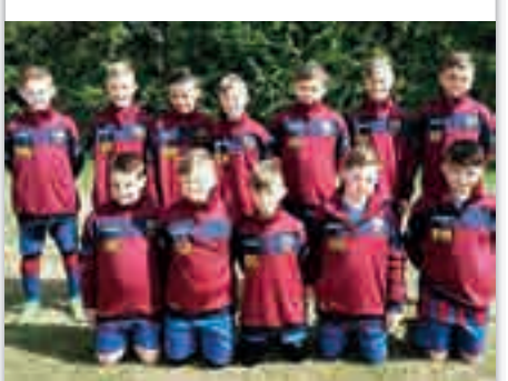
Great weekend of football again at ESF Festival Skeggy 2017. Brilliant tournament excellently run.....Wrekenton Nou Camp Oranges Under 10's had a great time.